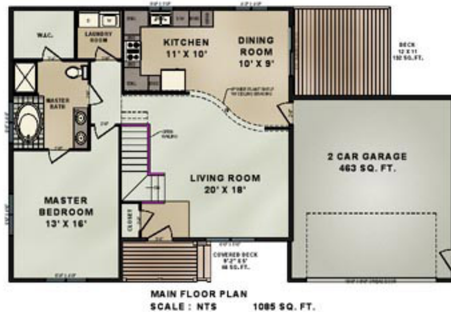
MAIN FLOOR PLAN SCALE : NTS 1085 SQ. FT.