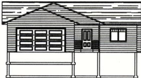
FRONT ELEVATION SCALE: NTS