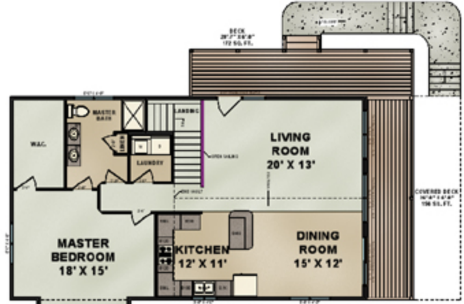
MAIN FLOOR PLAN SCALE : NTS 1201 SQ. FT.