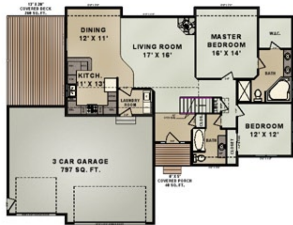
MAIN FLOOR PLAN SCALE : NTS 1480 SQ. FT.