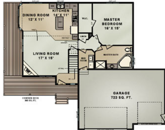
MAIN FLOOR PLAN SCALE : NTS 1165 SQ. FT.