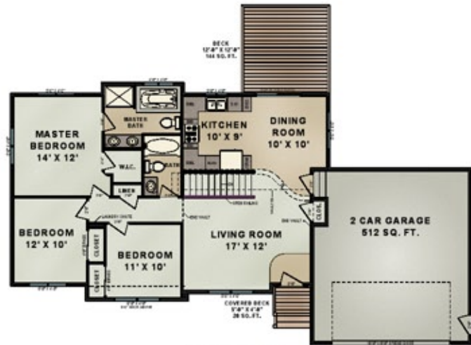
MAIN FLOOR PLAN SCALE : NTS 1167 SQ. FT.