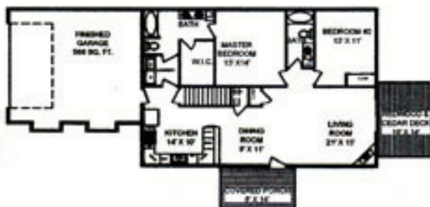
MAIN FLOOR PLAN SCALE: 3/8" = 1'-0" 1320 SQ. FT.

(605) 390-4000 Kaski Sales Team Rapid City