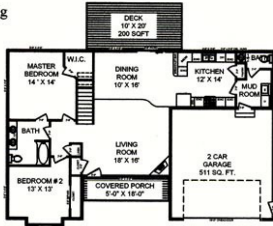
MAIN FLOOR PLAN SCALE: NTS 1353 SQ. FT.

(605) 390-4000 Kaski Sales Team Rapid City