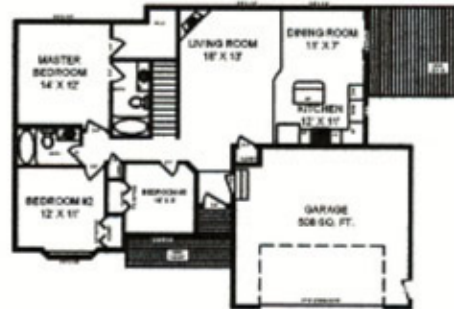
MAIN FLOOR PLAN SCALE: 1/8" = 1'-0"