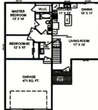
MAIN FLOOR PLAN SCALE: 1/8" = 1'-0"

(605) 390-4000 Kaski Sales Team Rapid City