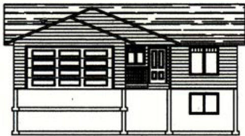
FRONT ELEVATION SCALE: NTS