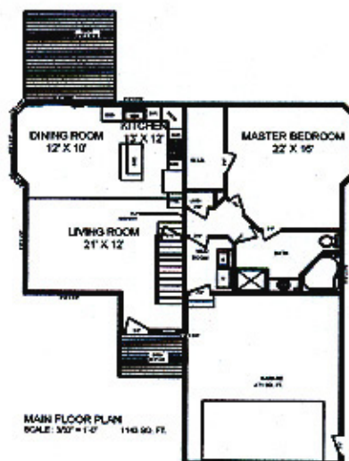
MAIN FLOOR PLAN SCALE: 3/32" = 1'-0" 1143 SQ. FT.

Cat 5 telephone jacks Moen faucets Garage is unfinished Insulated Martin garage doors with windows Metal fascia and soffit Seamless gutters 40 year Elk Prestique premium shingles Canxel / colorside siding Walk out lower level