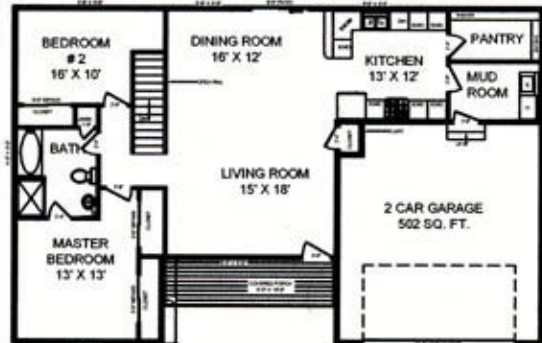
MAIN FLOOR PLAN SCALE: NTS 1352 SQ. FT.