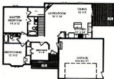
MAIN FLOOR PLAN SCALE 1/8" = 1'-0"

Blown-in fiberglass insulation R-22 walls R-38 ceilings