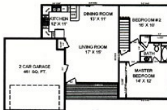
MAIN FLOOR PLAN SCALE: 1/8" = 1'-0"

(605) 390-4000 Kaski Sales Team Rapid City